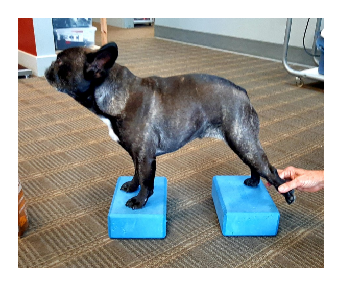
The Canine Fitness Centre Ltd.

Once all of this information is collected, a program can be designed that is appropriate for each individual dog to restore optimal motor control. It takes a coordinated effort with owners to carry out these programs but they are extremely motivated to return their performance partner to top competition level.